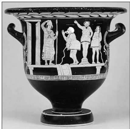
KRATER: Two-handled bowl, or krater, was part of the Fleischman Collection. The Getty bought it in 1996 for $185,000.